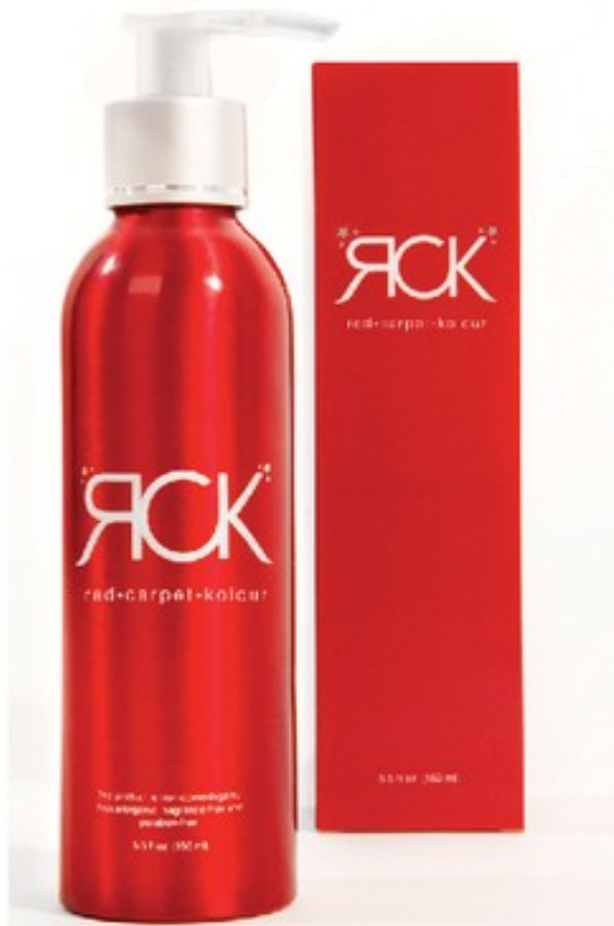
Red Carpet Colour Body Glow