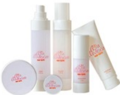
Ava Anderson's product line.